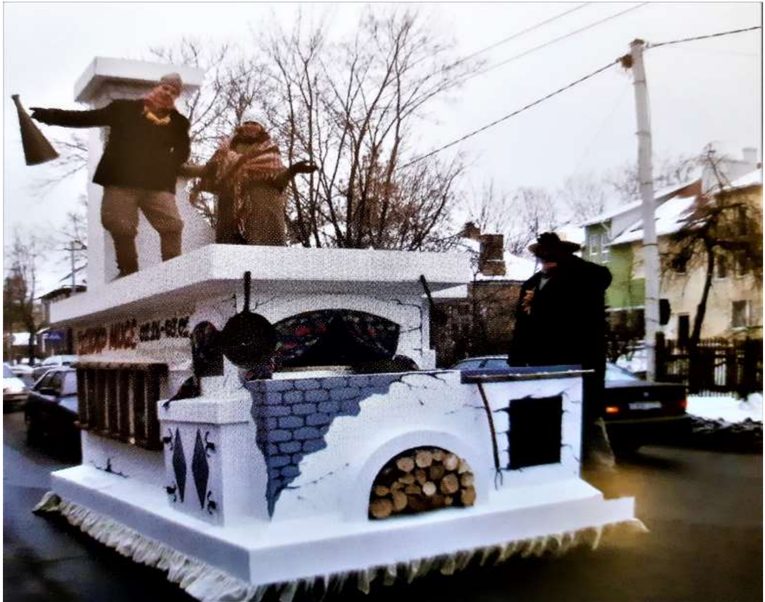
Dream for lazybones – the driving stove