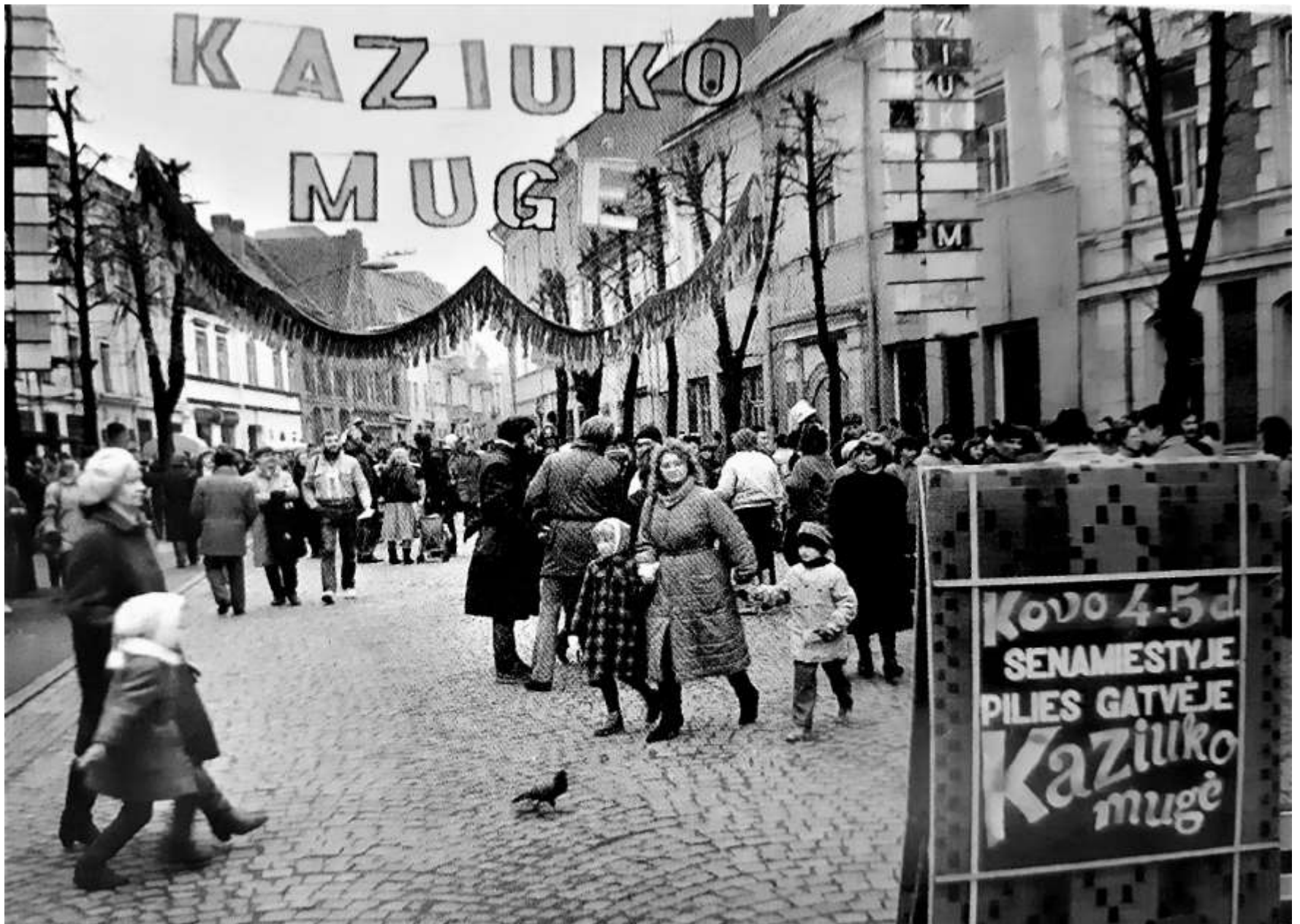
Kaziukas Fair returned to Pilies St. in the Old Town in 1989