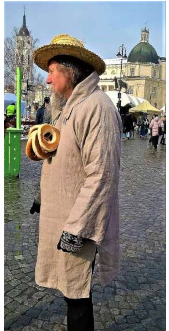
Lots of bagels, 2015