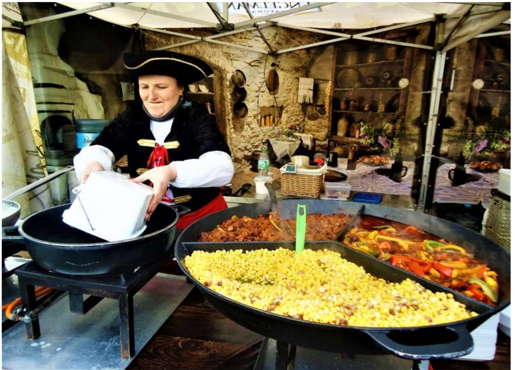
Culinaric temptations, 2015