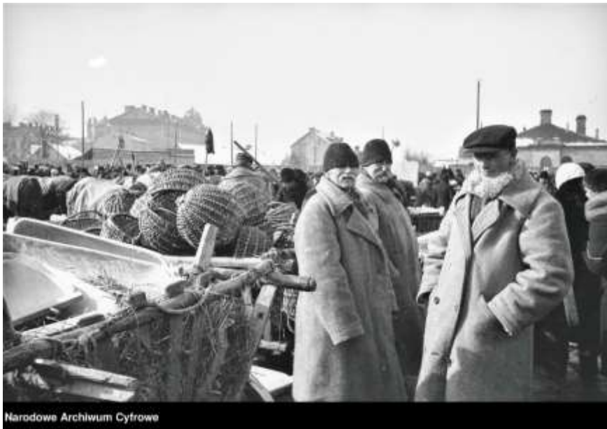
Narodowe Archiwum Cyfrowe