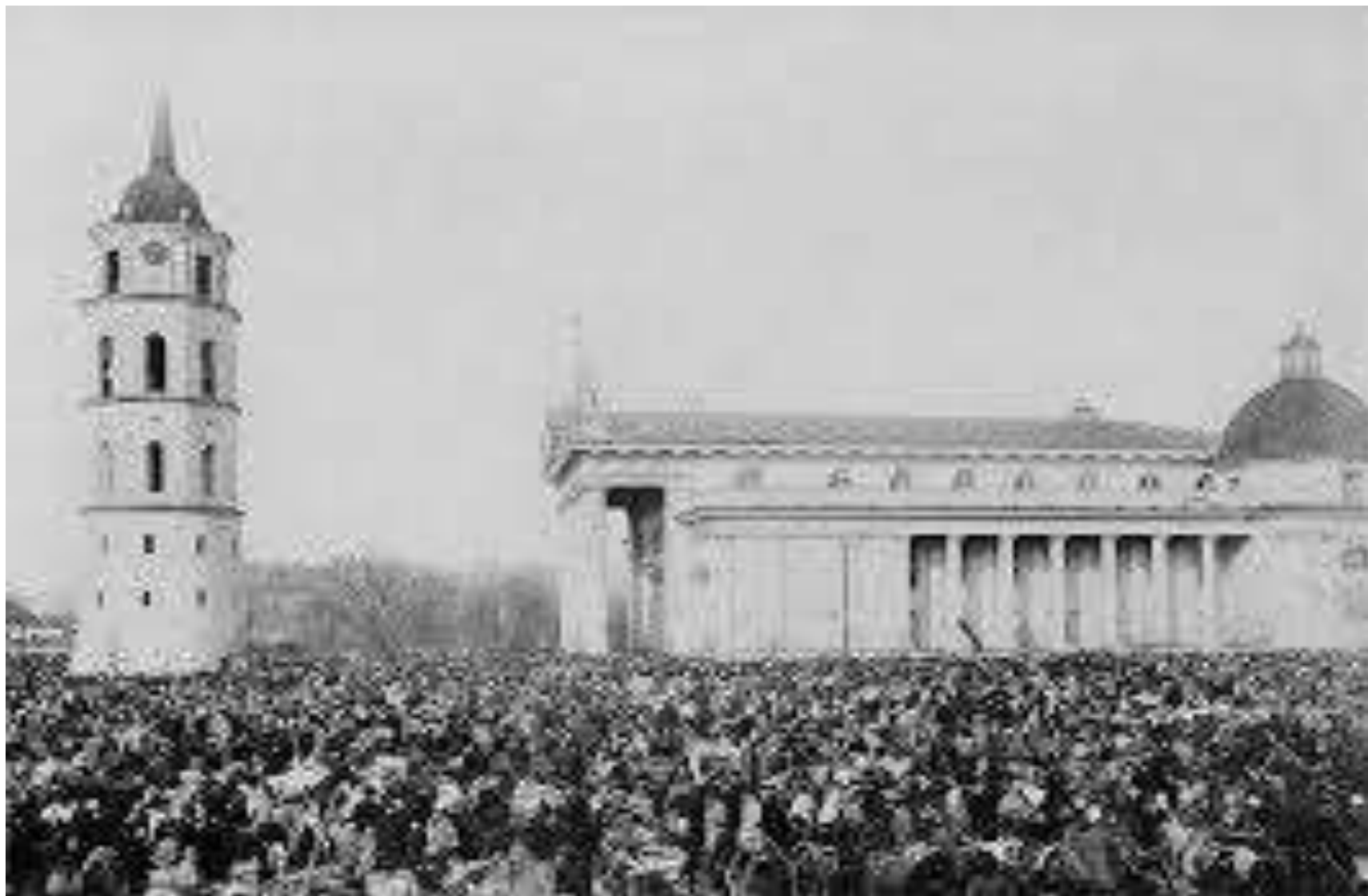
Crowdy fair in 1900 – 1910 at the Cathedral square