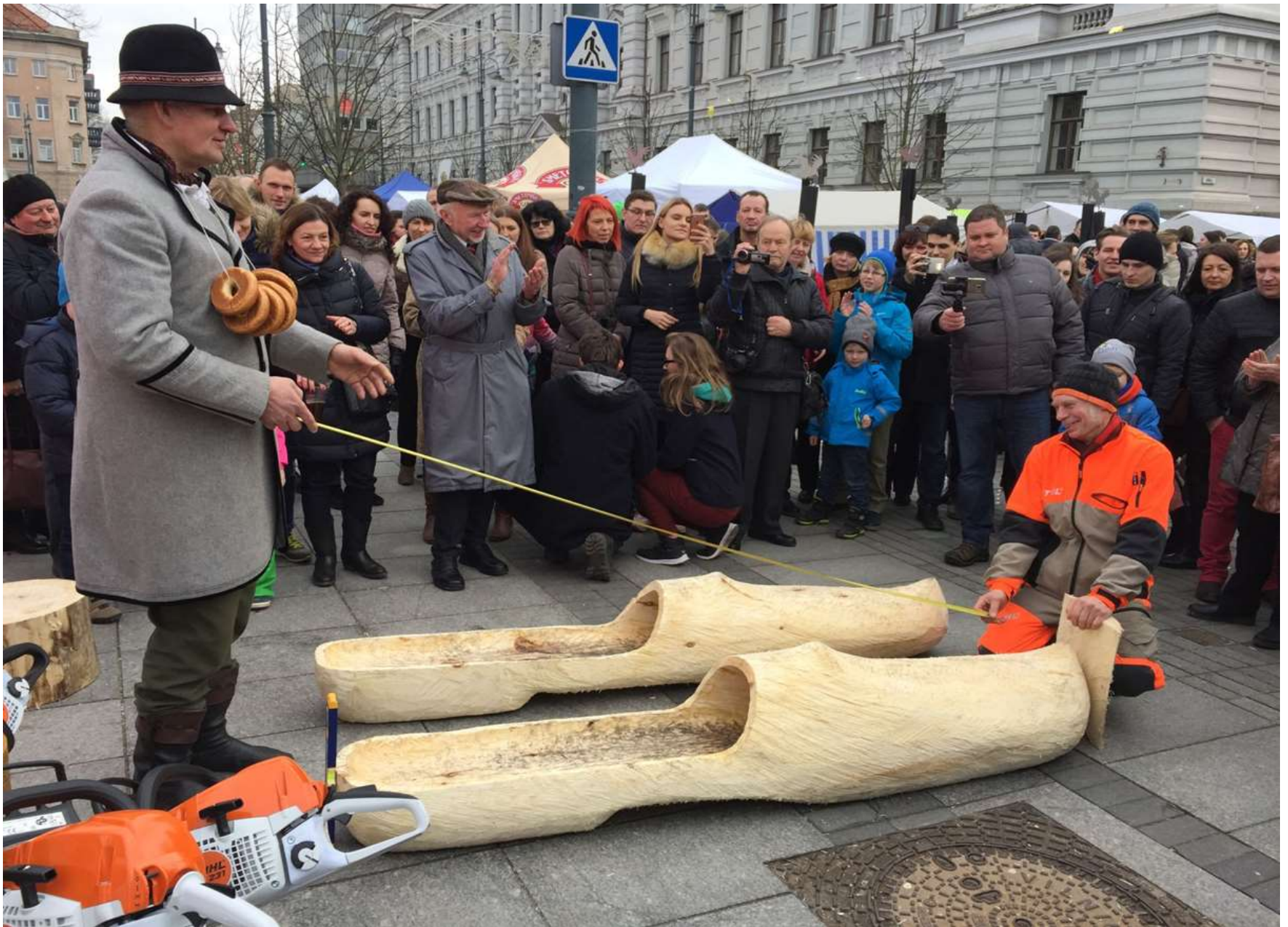
The largest clogs, 2017