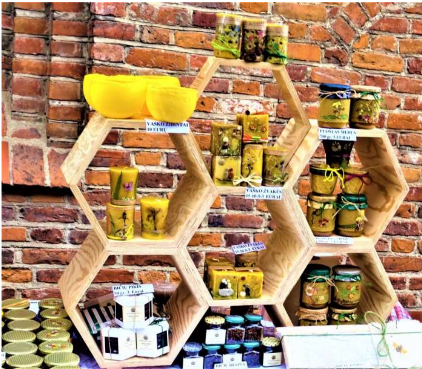
Production of beekeepers for body and soul, 2016