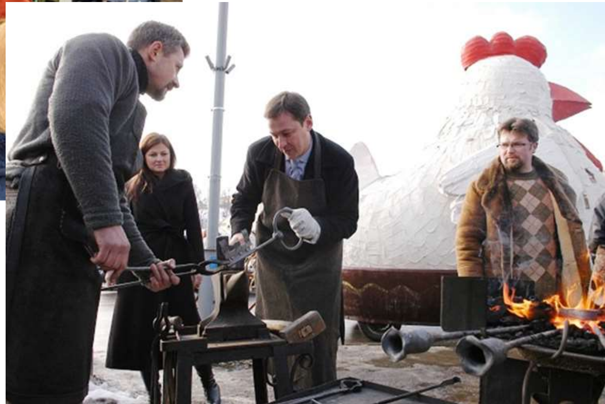
The Mayor Arturas Zuokas with his wife, 2004, 2007