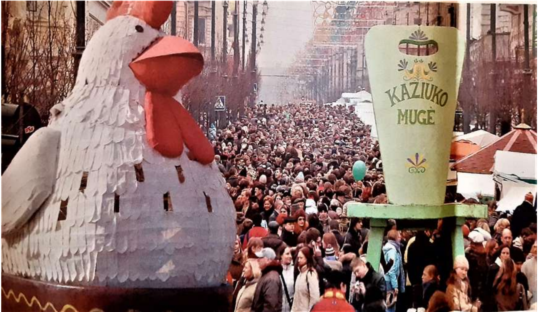
The Fair awakes the city, 2007