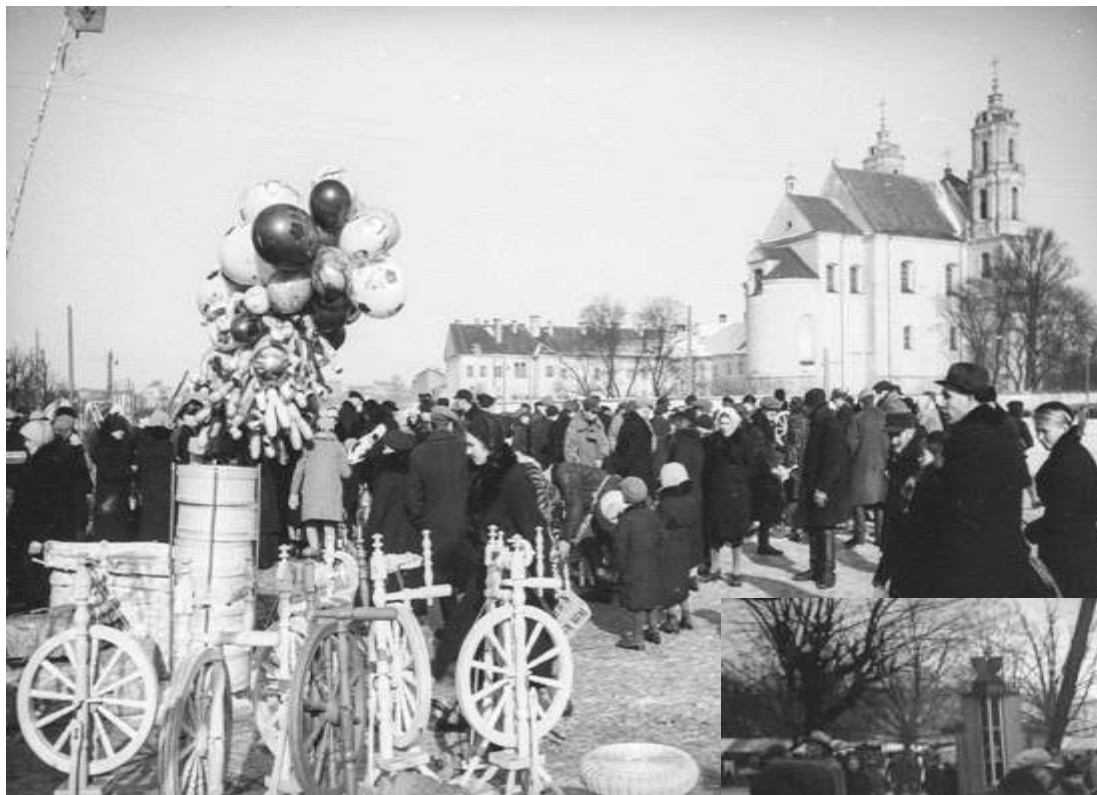
Joy for children: coloured balloons and wooden toys, 1938