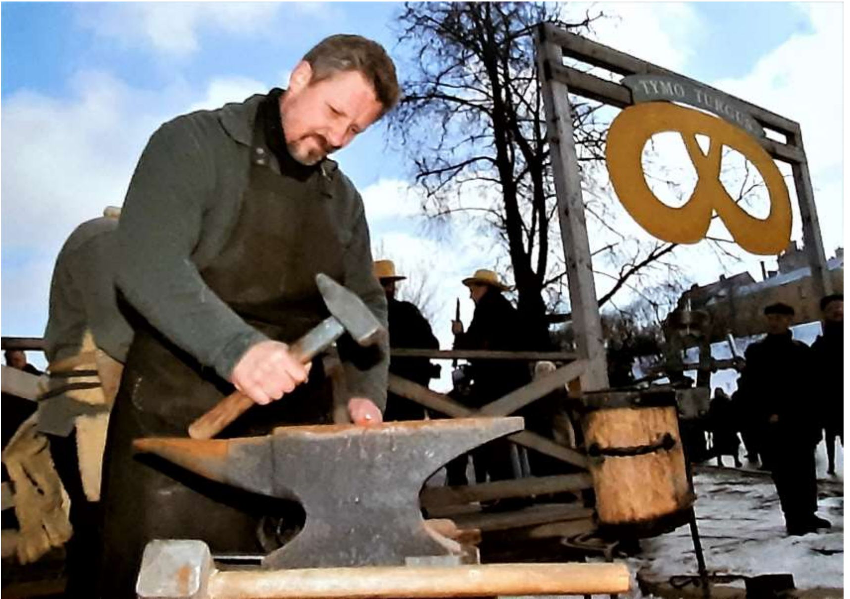
Participants of Vilnius Crafts Program demonstrate their crafts, 2005