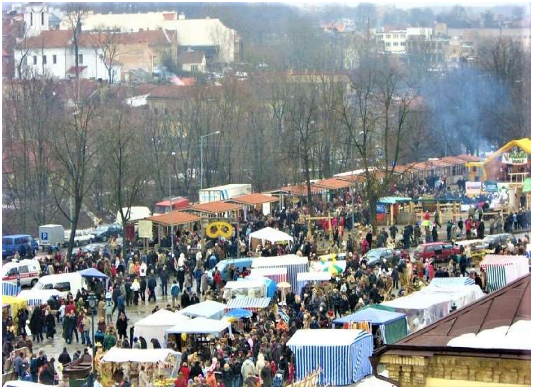
The Fair in the revived historic Tymas Quarter, 2007