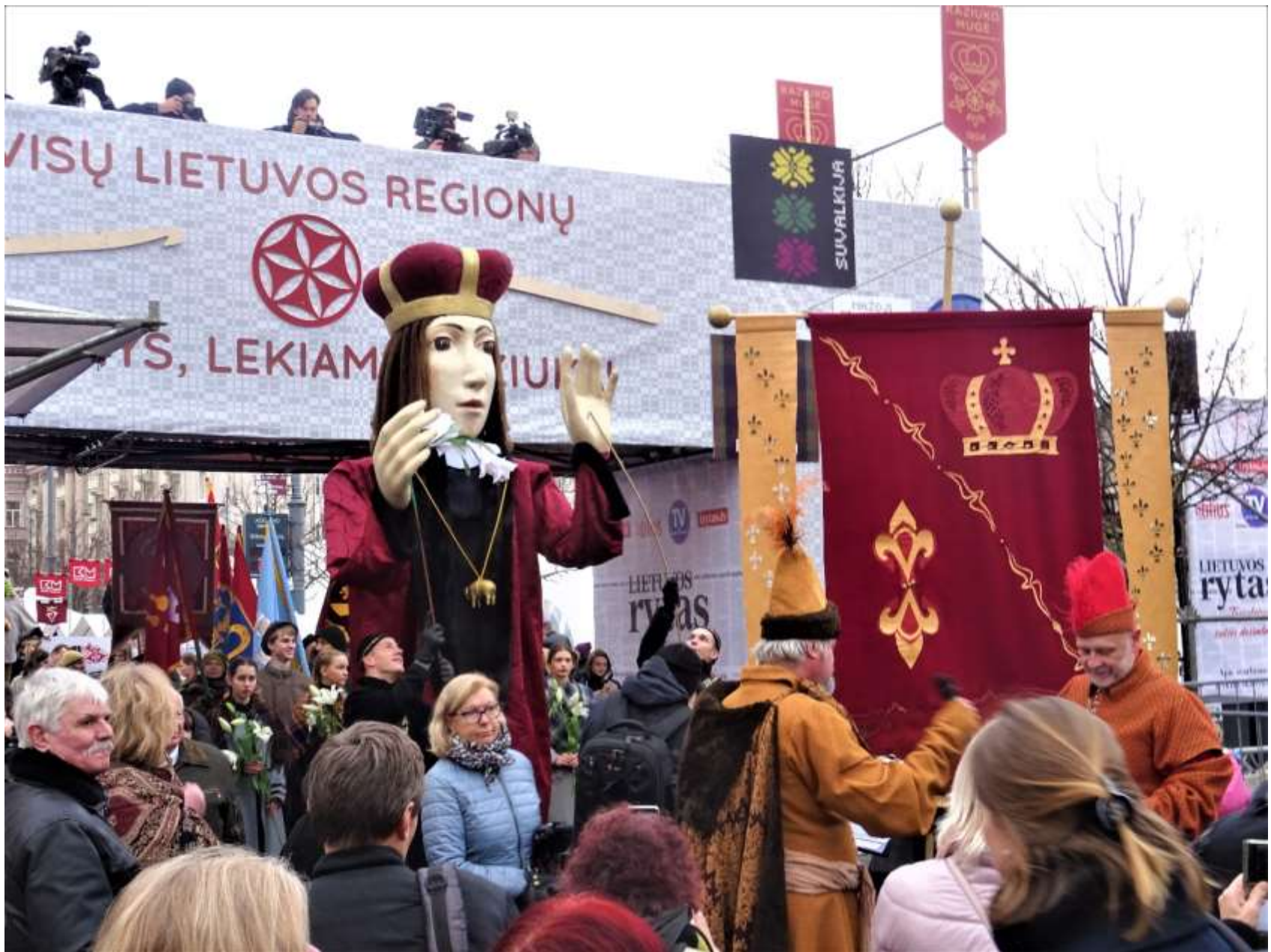
The 4 m bridge over Gediminas Avenue, 2019