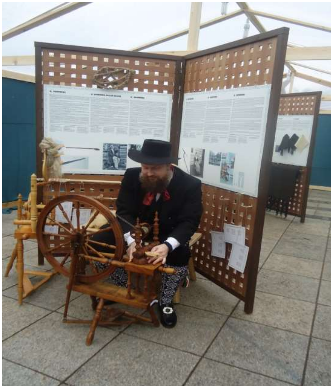
A participant guest from Norway, 2017