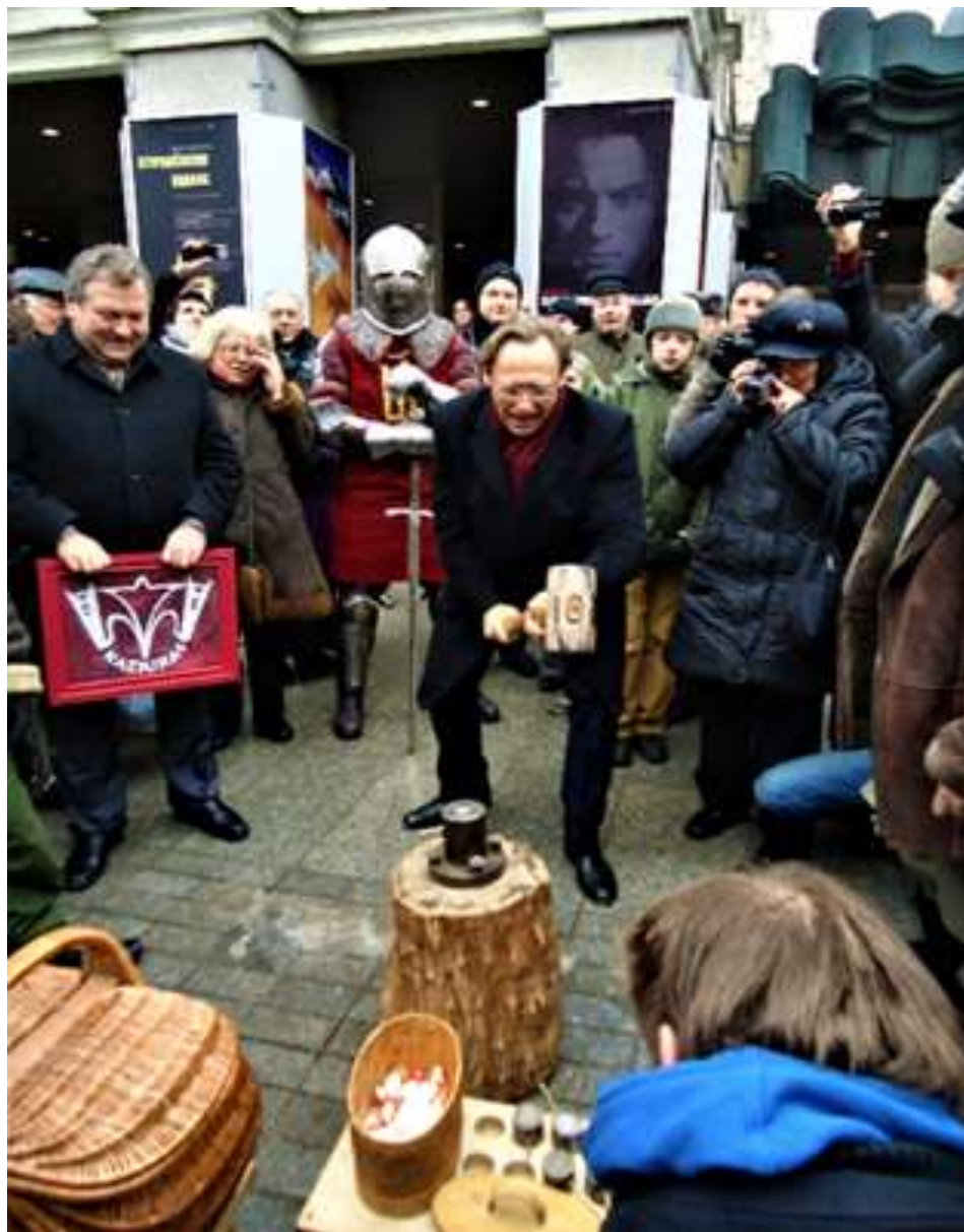
The Minister of Agriculture Kazimieras Starkevičius and Mayor of Vilnius Raimundas Alekna, 2011