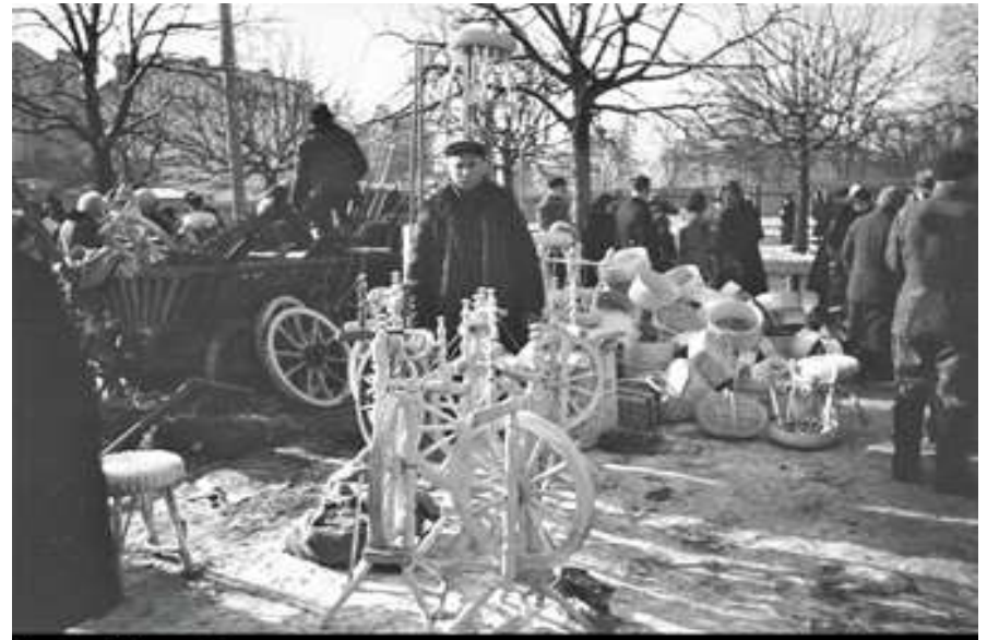
Narodowe Archiwum Cyfrowe