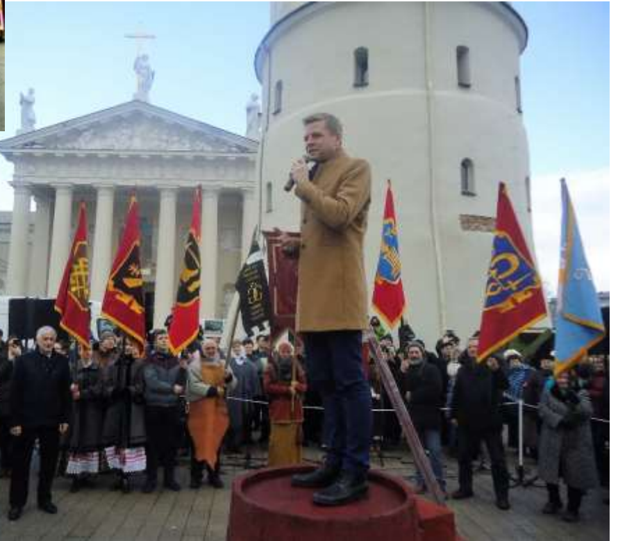
The Mayor Remigijus Šimašius, 2014, 2017