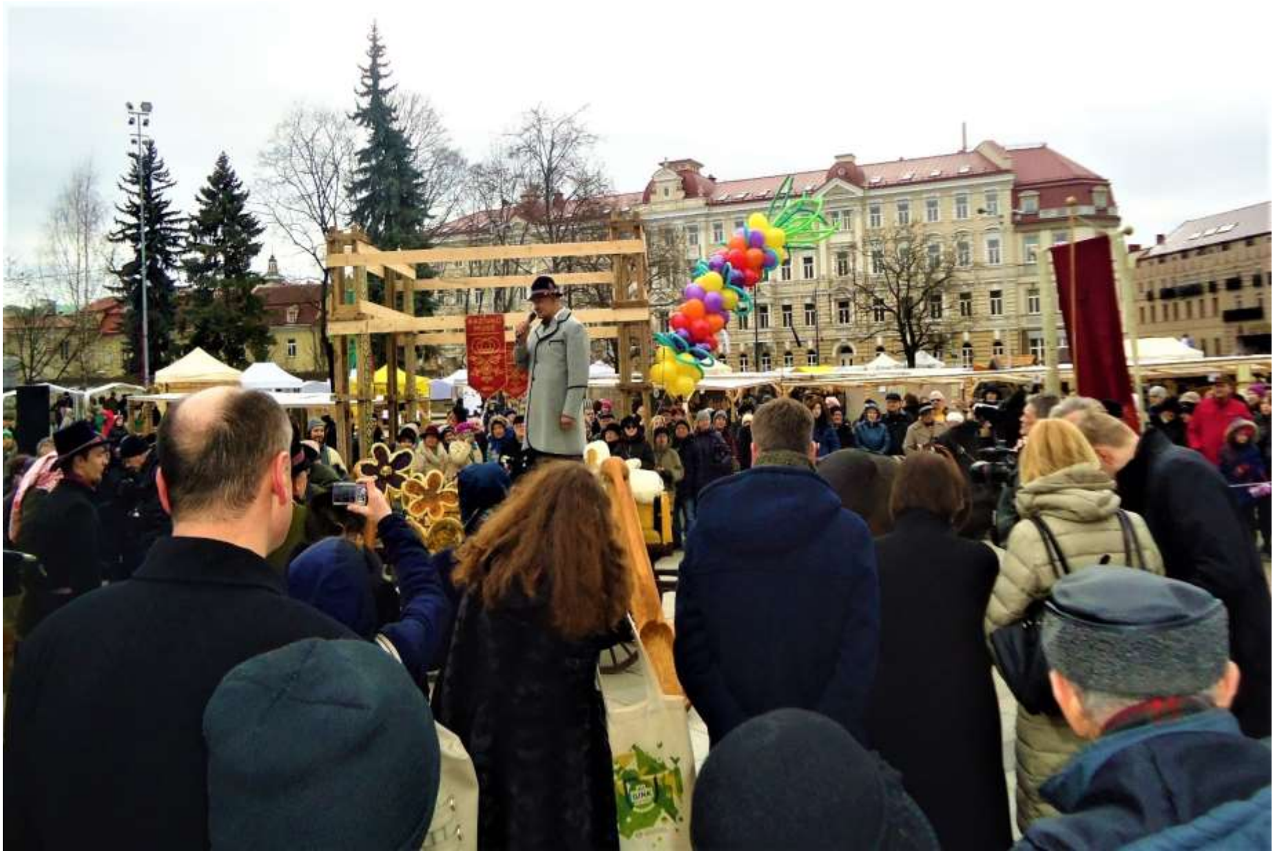
Welcome to Kaziukas Fair! 2016