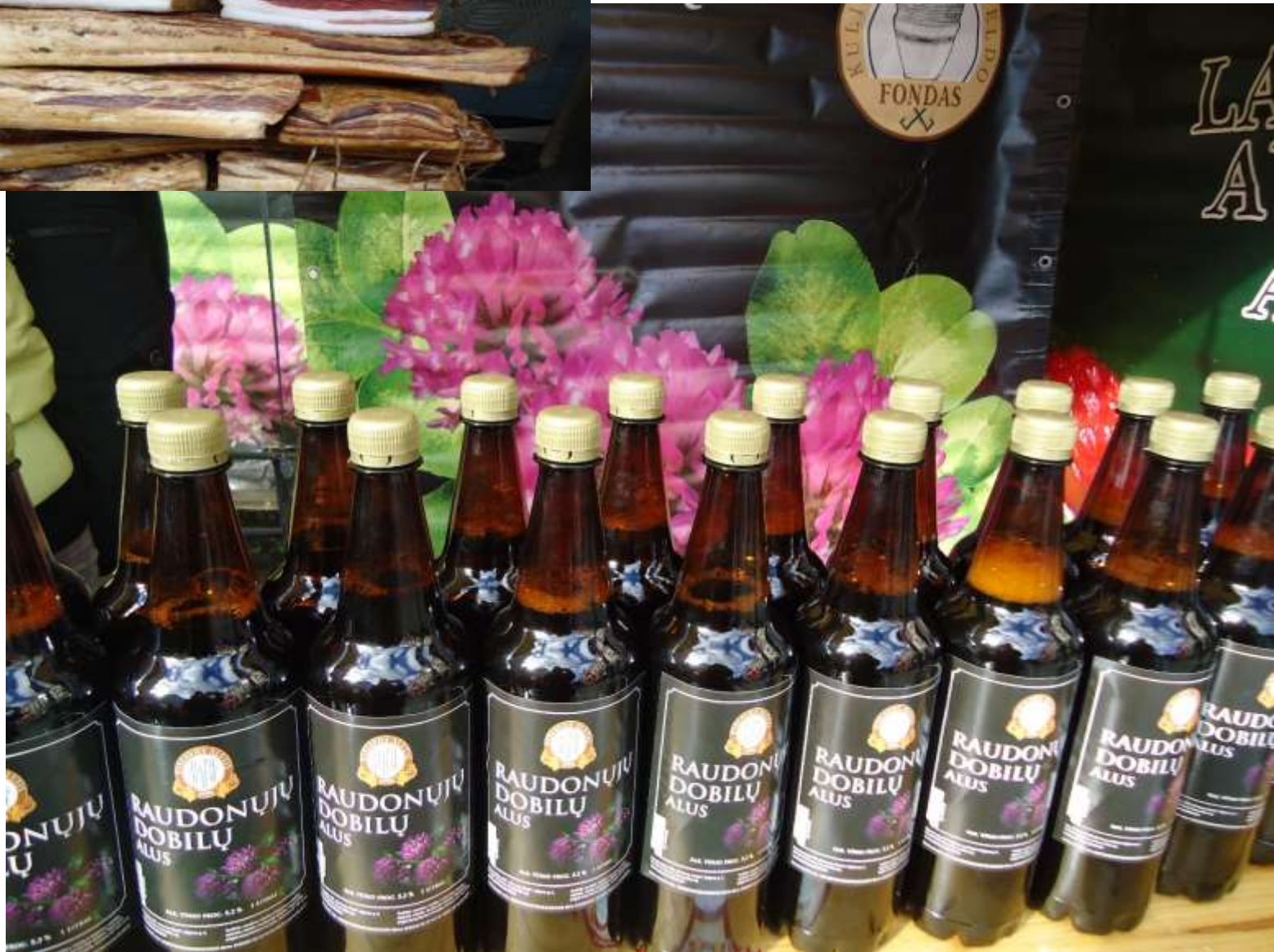
Red glover beer , 2013