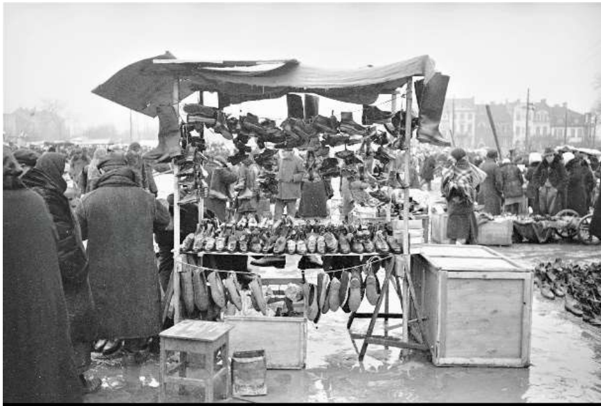
Narodowe Archiwum Cyfrowe